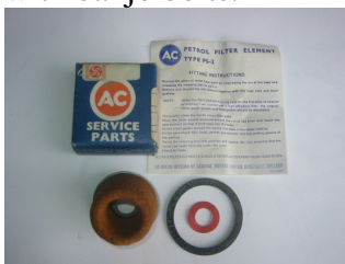
Molded Resin Cup for 340

Diecast (AC) filter housing with glass bowl, mounted on right side fender wall. Filter element is flat circular brass mesh only. Paper element was never correct for MK 2's. Molded resin cup shaped element fitted for 340. Ref: TB C32 Jan. 1968 Pg.33 Pub.E148/1 White nylon fuel lines heat shrunk onto cad plated banjo fittings, no clamps, held in place with banjo bolts.