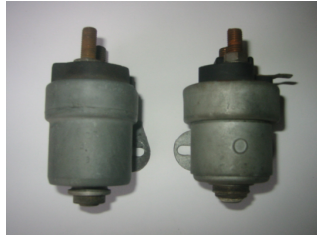
EARLY DESIGN ON LEFT

STARTER SOLENOID: Early design is die cast with integral mounting feet (left image in photo) changed to design with steel jacket and separate mounting clamp. [SB: Q35 April 1962]. There is a rubber boot covering the push button on both solenoids not shown in photo.