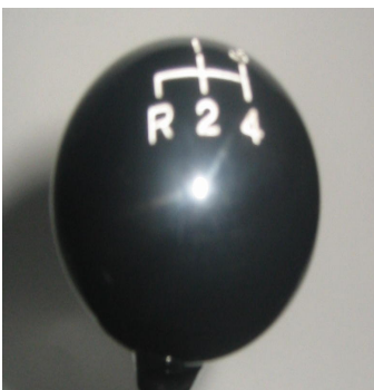
LATER GEAR KNOB BALL SHAPED

Early (non-synchro) Moss Box-Black plastic, light bulb shaped, and shift pattern shown under clear plastic top inside of a white circle on an insert glued into recess in the knob. Black plastic spherical with engraved shift pattern on later models and 240 and 340. Shift gaiter – leather without chrome ring top trim on MK 2's. On 340 also there is no chrome ring. [Kennedy, Jaguar, The Classic Marque , p. 113]. Chrome plated lever is not bent and is tapered small end at the knob.