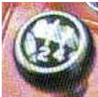
EARLY GEAR KNOB LIGHT BULB SHAPED