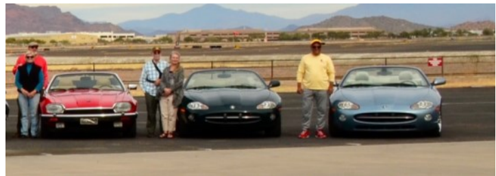
Commemorative Air Force Airbase of Arizona (CAFAZ) Museum, pg 5