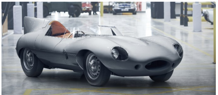
Jaguar Restarts Production Of Legendary D-Type Race Car, pg 7-9