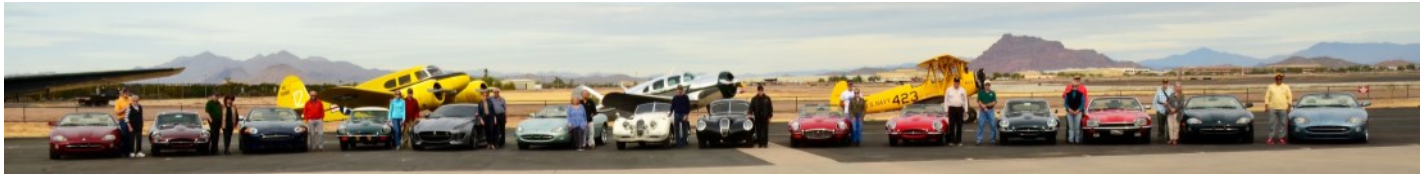
JCCA members and their cars photographed with vintage airplanes.

JCCA members toured the Arizona Airfield of the Commemorative Air Force in Mesa AZ on Saturday, January 6.