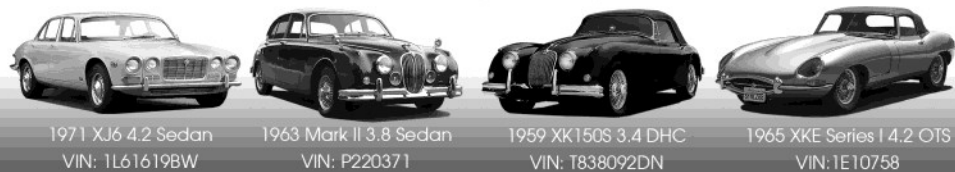
1971 XJ6 4.2 Sedan VIN: 1L61619BW

From a diverse selection of fine, classic Jaguar examples available from our showroom..