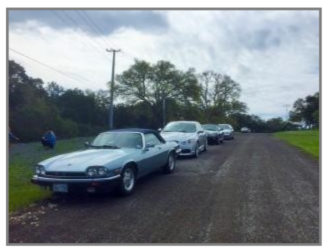
Beautiful Jaguars lined up next to the bluebonnets on a stop during the Spring Driving Microbrewery Tour.