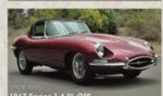
VIN: 1E01915F 1967 Series 1 4.2L OTS