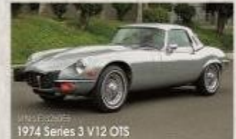
VIN: 1E02505F 1974 Series 3 V12 OTS