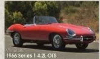
VIN: 1E0881 1966 Series 1 4.2L OTS