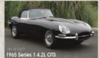
VIN: 1E0277 1965 Series 1 4.2L OTS