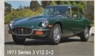
VIN: 1E0715 1971 Series 3 V12 2+2