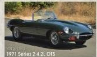
VIN: 1E012501 1971 Series 2 4.2L OTS