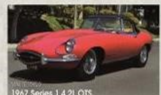
VIN: 1E02660 1967 Series 1 4.2L OTS