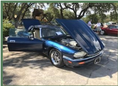
Fred Bricker's Metallic Blue 1995 XJS Conv.

25600 IH-10W, exit 550 (Ralph Fair Rd) Boerne, TX 78006 www.alamosportscars.com