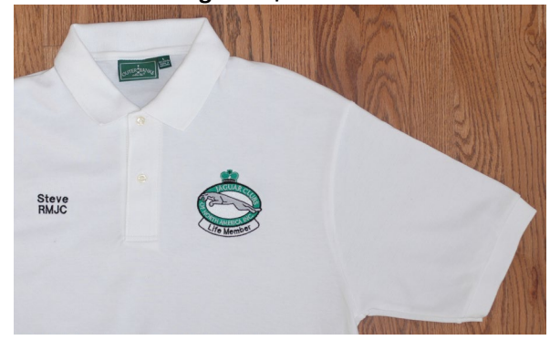
Polo Shirt with JCNA Logo and Life Member