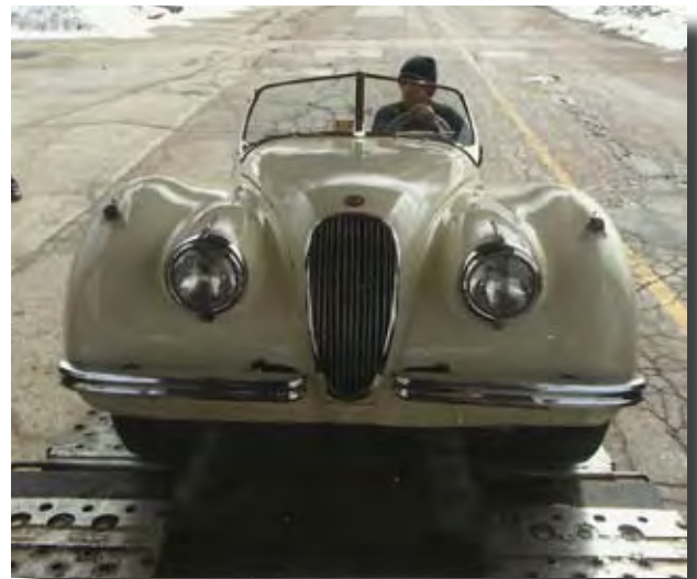
Intercity Transport driver offloads the XK120 at its new home in MA.