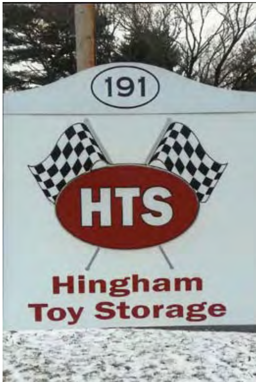
The sign says it all! Where Alec's new "toy" will spend winter months, in climate control storage.

Bonnie said, "Yes." She said the next thing she knew she was looking for a grab handle.