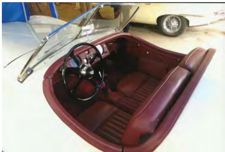
At last...our own 120!

PO Box 245 Wyoming, Rhode Island 02898, USA Tel: +1-401-539-3010 • E-mail: jagwillie@bassettsinc.com www.bassettsinc.com