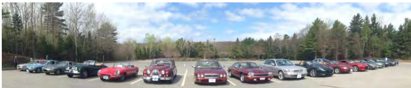
Over 60 years of Jaguar were represented during the Bar Harbor tour as seen in this impressive lineup.