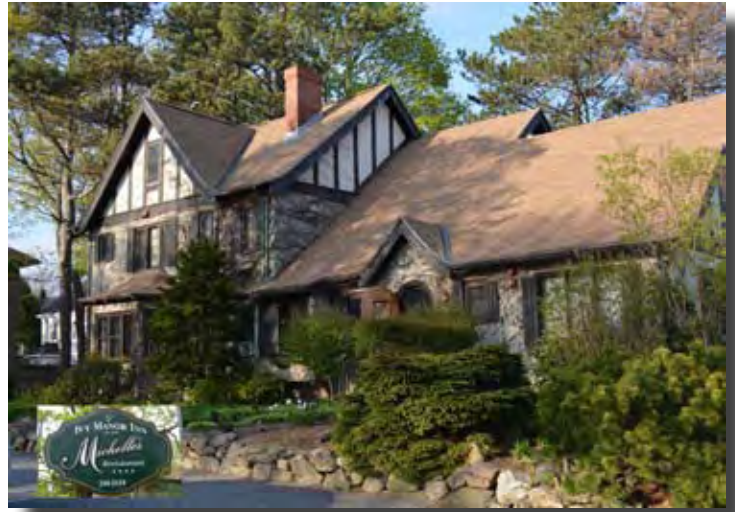
First stop on the tour, the Ivy Manor Inn, where Jaguar of Scarborough sponsored a reception.