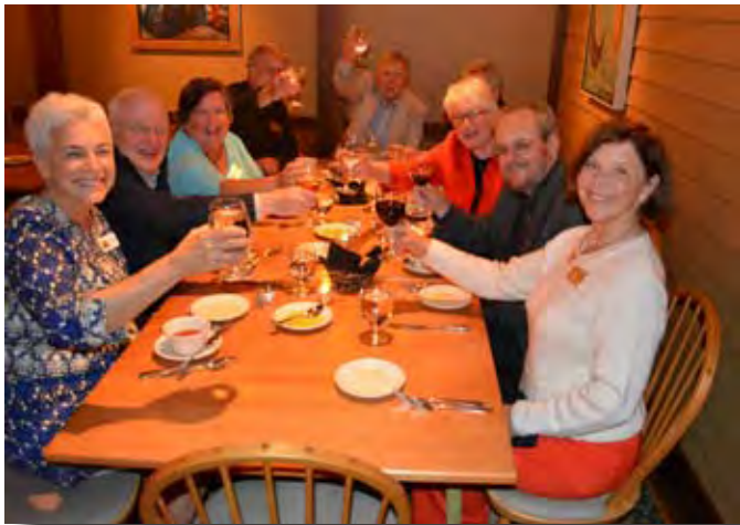
Happy tourers gathered at Galyn's Restaurant Saturday evening for a banquet and awards.

Pub Tour" sponsored by the Chamber of Commerce. It was a great chance to sample some regionally-produced beer and wine and find a suitable place for dinner.