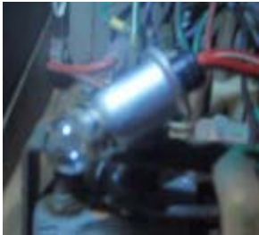
Bulb Holder Sockets

By withdrawing the bulb holders from the gauges, the old bulbs can be unscrewed and the new LEDs screwed into place. The holders can then be reinserted into the back of each gauge and voilà - job complete after repositioning the center instrument panel and fastening with the thumb screws. But I did not want to stop here.