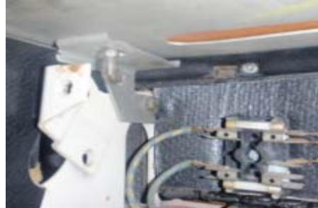
Above: Inside the center instrument panel and under neath the dashboard. This view is of the left side. Note 5/16 retaining nut on vertical screw, and Phillips head screw at upper rear. The right side is identical. All four must be removed in order to lift out the dashboard.

left and right sides and are held in place by 5/16" nuts and lock washers. The other two fasteners are screws that secure the front edges on the dashboard. Care must be exercised when removing and installing these fasteners as a dropped item will be lost forever within the center instrument panel compartment. The photograph below provides the location of the fasteners on the left side of the panel.