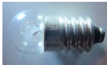
Traditional Incandescent Bulb

All of the gauge bulbs are 10mm screw base. I used white LED E10 5 5050 SMT bulbs as replacements. These bulbs have individual LEDs. While the screw base is round, the surface on which the LEDs are mounted resembles a small cube or tower. The individual LEDs are mounted one on each side of the cube and one on the top. Such a setting is referred to as "surface mount technology" or SMT which appears in the bulb's identifying number. Each SMT LED has an output of about 14 lumens, so one LED bulb has an output close to 70 lumens. Compare that to the 3.77 lumen output of a 1446 incandescent bulb and the difference is – well – like day and night. Out of darkness. And LEDs use a small fraction of the current.