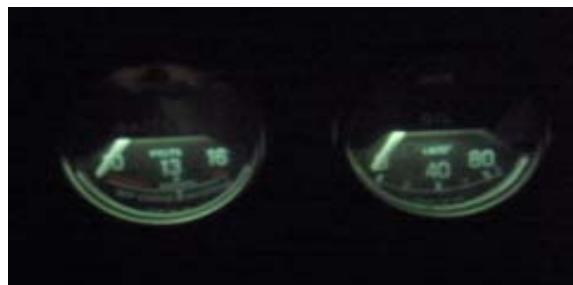
Truly, out of darkness. . . !

The style of LED bulbs used is up to the individual. If one prefers a more traditional looking bulb, short round LEDs or tall round LEDs can also be used. While the bulbs themselves are not noticeable after being installed, I personally like the SMTs.