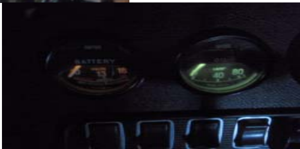
Below: Note the difference: Left: Incandescent Right: LED

My E-Type also had 986 12V 2.2W OSRAMs in both the speedometer and the tachometer. Two were in each meter located at roughly 9 o'clock and 3 o'clock as one faces the meters. These bulbs are more difficult to replace as they cannot be accessed from the bottom of the dashboard without removing a number of components. However, having the center instrument panel open provides ready access to key fasteners to remove the top of the dashboard. I opted to remove the dashboard top to access the backs of these meters.