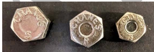
CRANES used elsewhere but not on the subframe

Three examples of each bolt are shown because the bolt heads are slightly different for each of the three examples per manufacturer.