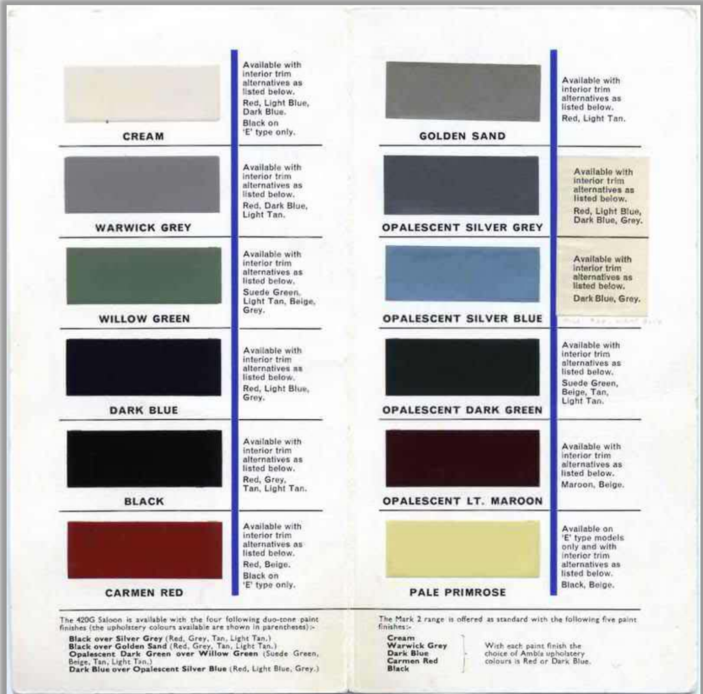
Jaguar Color Chart