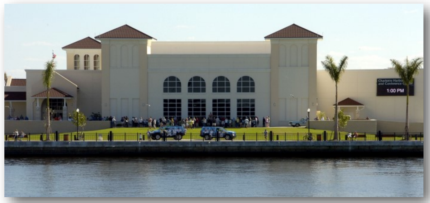
Charlotte Harbor Event and Conference Center Rear Patio