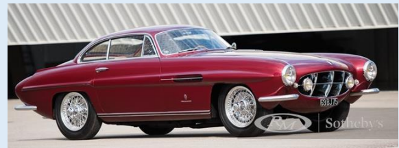
1952 Jaguar XK120 Supersonic by Ghia Sold for $2,062,500, inclusive of applicable buyer's fee, at RM Sotheby's Monterey Auction, August 13-15, 2015.