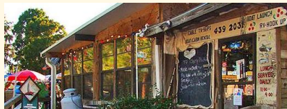
Great Food, Clean Outhouse, and 'Interesting' Clientele!

We got lunch at Peebles Bar-B-Q in the town of Auburndale, toured some villages and parks, and finally reached our destination: Cherry Pocket .