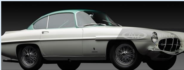
1956 Aston Martin DB2/4 Mk II 'Supersonic' by Ghia Sold for $2,310,000, inclusive of applicable buyer fee, at RM Sotheby's New York Art of the Automobile Auction, November 21, 2013.

In fact, that was a 1953 Fiat 8V, but it could easily be confused with any of 20 Ghia "Supersonics," including: the original Alfa Romeo (destroyed in a crash and subsequent fire at the 1953 Mille Miglia); 15 on the Fiat 8V chassis; three on the Jaguar XK120 chassis and one on the Aston Martin DB 2/4 chassis.