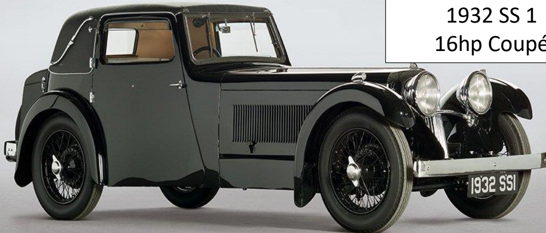
1932 SS 1 16hp Coupé