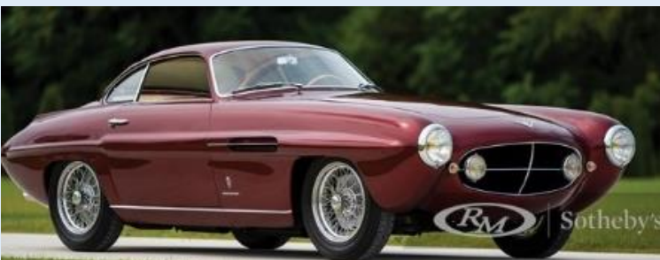
Offered Without Reserve, 1953 Fiat 8V Supersonic by Ghia at RM Sotheby's - The Elkhart Collection, October 23-24, 2020.