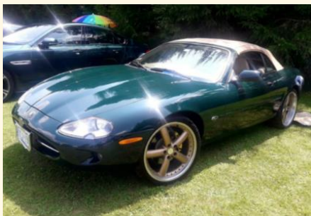
It was time for my coronation as "King of the Road!"

Ohhh! My heart was pounding! British Racing Green, a Tan convertible top & interior.