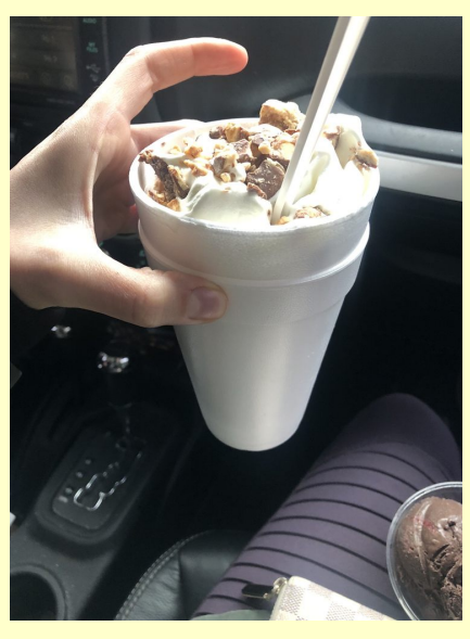
By Pete Galinowski

End of Summer and the JCOP is having an Ice Cream Social. Drive to Custard's, 315 Camp Horne Road. for our first ever Ice Cream Social. Show up at 1:00 PM on Saturday September 19, 2020 to partake of any desserts that makes your mouth happy or if you want food, they have a sandwich menu. Bring your mask, your other, your kids (grandkids), your mouth and tummy, as there is picnic seating or use your car. We will not be doing much socializing other than a "Hi". To last until 2ish or so.