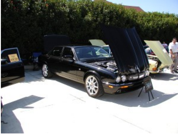
Brad Autry's Black VDP