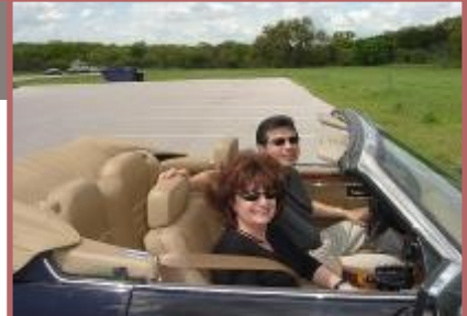
My favorite Jaguar...Black 1994 XJ-S Convertible—sold with 119,000 mi.

Stay Safe & well, everyone! Fran, Editor of The Jagged Edge