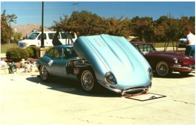
Spence Mann's Blue 1967 XK-E Coupe