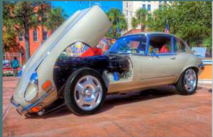
Victor's 1971 XKE Series 3-6 liter Coupe aka "Chewy"