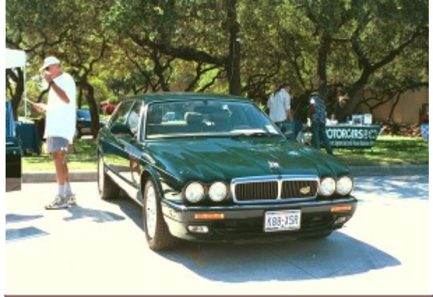
Paula Blackwell's BRG 1997 XJ6L