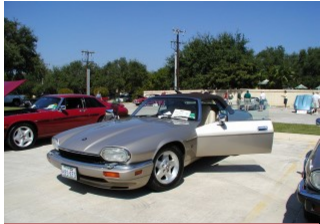
Jayne Iffla's Topaz 1995 XJ-S Convertible