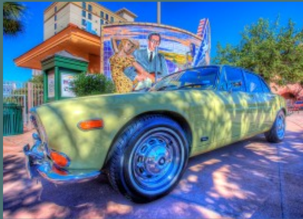
Victor's yellow 1971 XJ6 aka "Grandma"