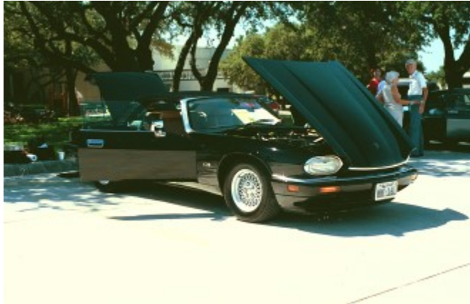
Fran Curran's Black 1994 XJS Convertible