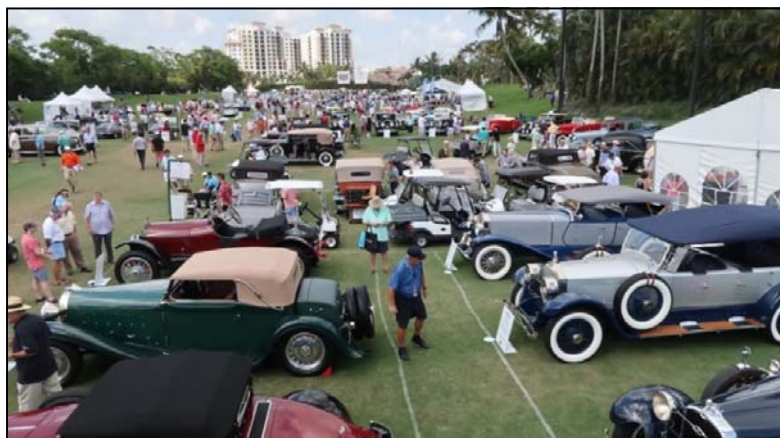
Note the green grass and warm weather attire. Lots of incredible cars and people (yes it is February):

Numerous vendors were present. The main sponsor was the Rick Cage Auto Group. Some of the other vendors: other automotive groups, electric bicycles, prestige watches, artwork, health, car auction houses, and many more.