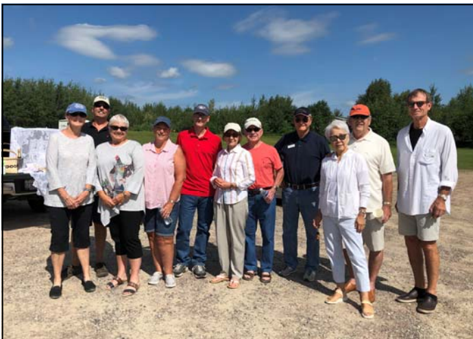
A Group photo.