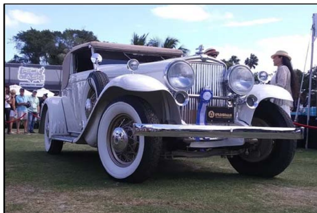
Do you remember White Walls?