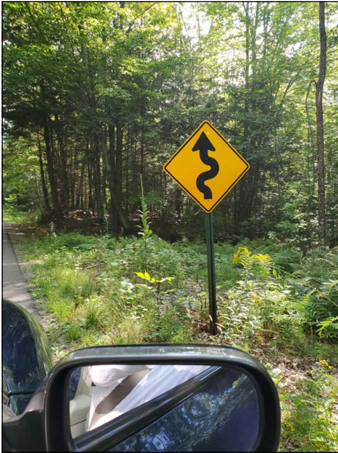
This looks to be a nice drive.