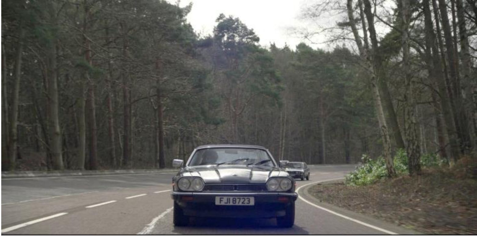
Diana's Jaguar XJ-SC convertible in "The Crown," Season 4, Episode 9, entitled, "Avalanche" (above and below)