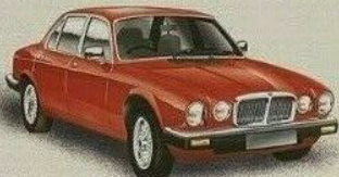
1968 XK 6 - 4 cyl. 3600 cc.