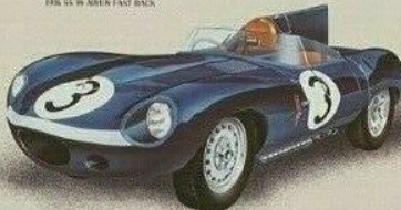
1954 JAGUAR TD - 800 cc. 200 hp. 120 km/h.