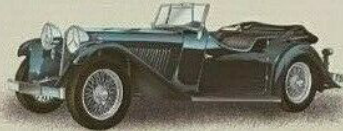
1955 XK 90 - 4700 cc.