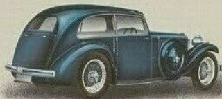
1936 XK 90 BIRKIN FAST BACK