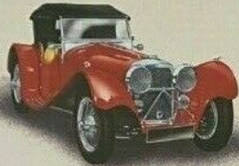
1936 XK 100 - Roadster - 2700 cc.