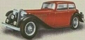
1936 XK 100 - 4 cyl. 2700 cc.