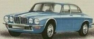
1972 XJ12 V12 - 5000 cc.