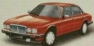
1966 XK 5.9 - 4 cyl. 2973 cc. 129 hp.