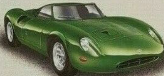
1957 XK 120 experimental - 1948 cc. 300 hp.