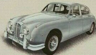
1964 XK 2.5 - 6 cyl. 3000 cc. 200 hp.