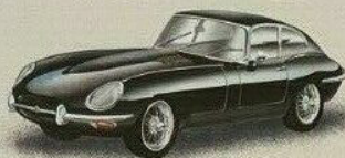
1964 JAGUAR E Coupé - 4 cyl. 3600 cc. 263 hp.