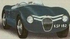
1955 JAGUAR TC - 3400 cc. 200 hp.