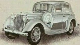
1936 XK JAGUAR - 4 cyl. 2664 cc.