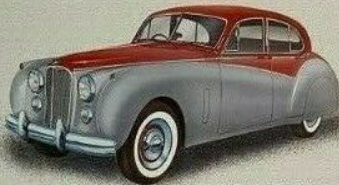
1954 XK 9 - 4 cyl. 3487 cc. 345 hp.