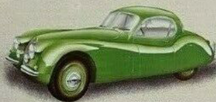
1939 XK 120 Coupé - 4 cyl. 2842 cc.