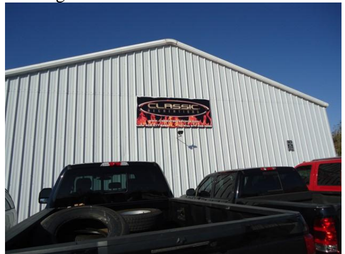
Final assembly building at Classic Recreations in Yukon.

The next building we visited was the paint shop. This is where we actually could see a Mustang ready for painting. The priming was as good as most finished cars needed. We then headed to the final assembly building.