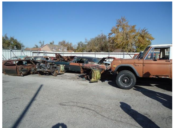
Bone yard of some of the Mustangs for parts.

Before I go on I need to fill you in on what Classic Receptions actually do. This company in Yukon is made up of a multitude of talents. For one they are licensed by FORD motor company to manufacture (or recreate) the 1966 through 1968 Mustang including being licensed by the Carroll Shelby company to produce the Shelby performance Mustangs. By performance I mean like from 400 horsepower to over 700 horsepower. In