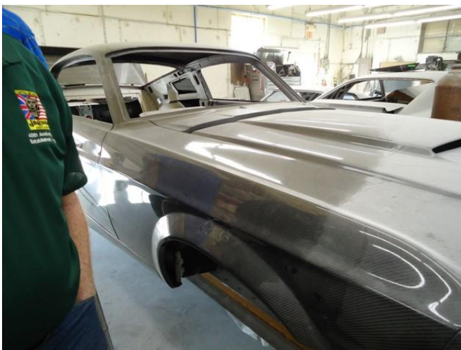
The Carbon Fiber Mustang just out of the mold.

The next part of the tour was seeing the Mustangs undergoing the fabrication and modifications to the chassis needed to accept the new high powered engines which the original Mustang would be unable to handle. While we were there we also had a chance to see one of the Carbon fiber cars just out of the mold.