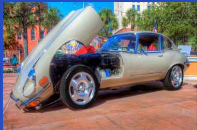
Victor's 1971 XKE Series 3-6 liter Coupe aka "Chewy"