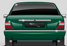
SIXTH GENERATION (1997 - 2003)