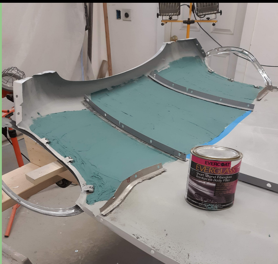
Kevlar reinforced polyester filler

I applied two thin coats to the underside of the bonnet. I chose to start at a point just forward of the radiator rock screen and brought the material back to the bonnet opening. Per the directions for the product, I top coated it with a skim of regular filler. The Kevlar reinforced product is green, as shown in the following photo. Also notice that I installed the headlight chromes to hold the edge of the headlight opening in the required position. I had previously fit these so I felt confident that they would hold the required profile.