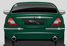
SEVENTH GENERATION (2003 - 2007)