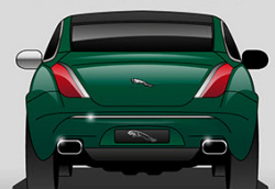
NINTH GENERATION (2009 - PRESENT)