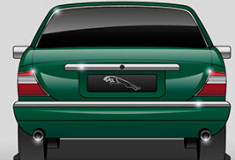
FIFTH GENERATION (1994 - 1997)