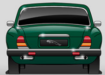
THIRD GENERATION (1979 - 1986)