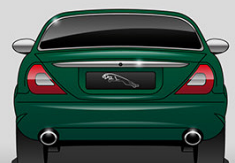
EIGHTH GENERATION (2007 - 2009)