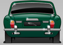
FIRST GENERATION (1968 - 1973)