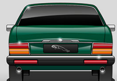
FOURTH GENERATION (1986 - 1994)