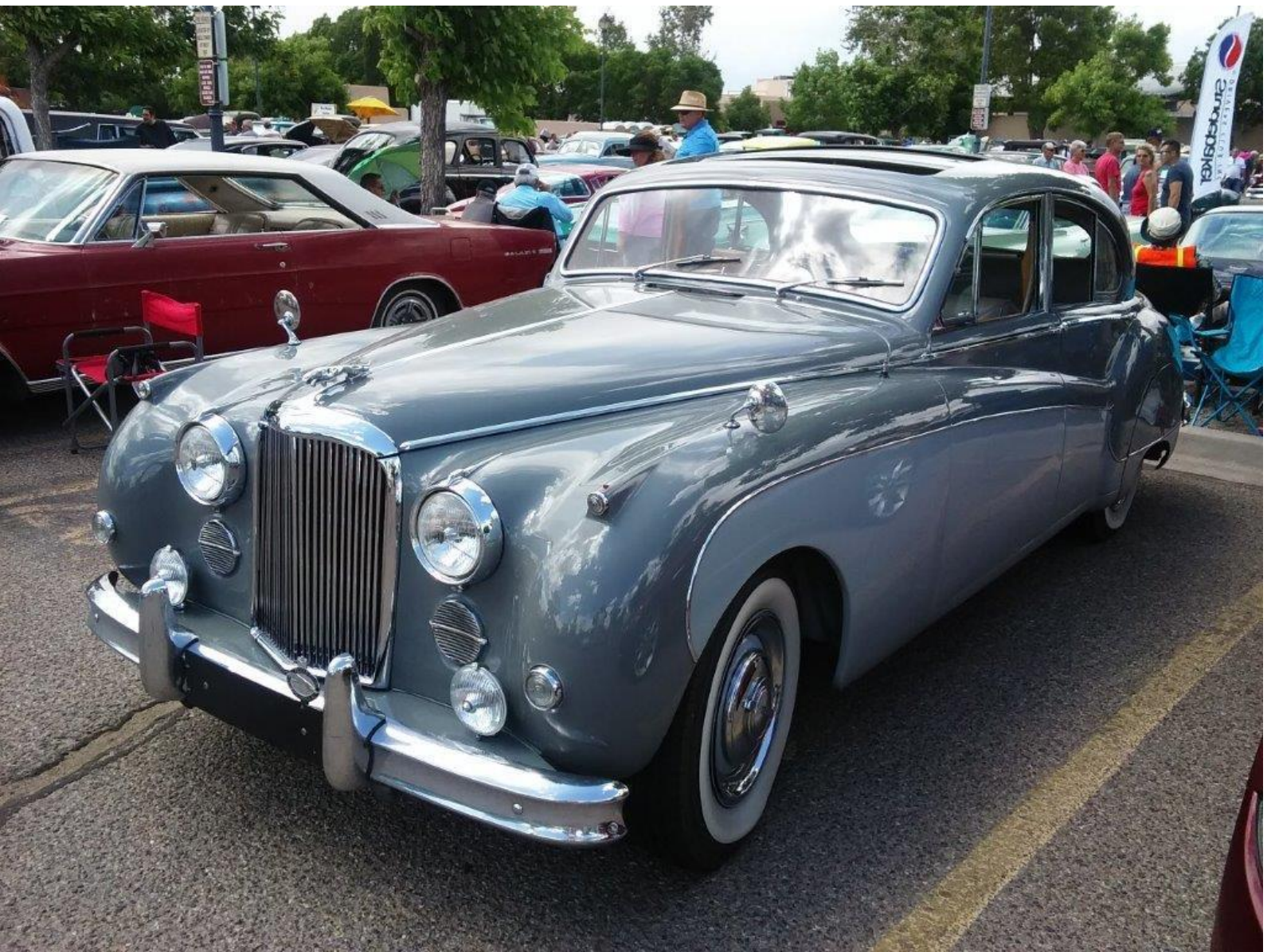
Another beautiful car owned by a Jaguar Club of New Mexico member – a 1959 Jaguar MK IX (above)