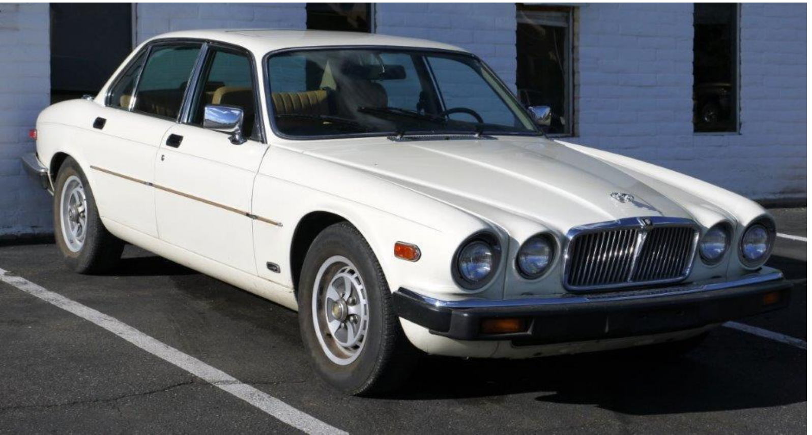
Lyle's lovely 1987 Jaguar XJ6 (above) and 1971 Jaguar E-Type (below)