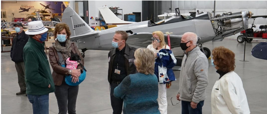
Several members of the Rocky Mountain Jaguar Club attended.