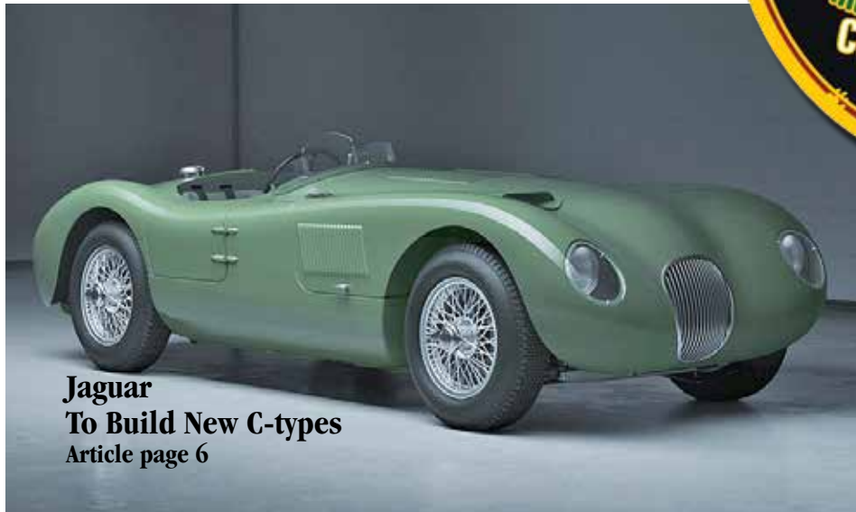
Jaguar To Build New C-types Article page 6