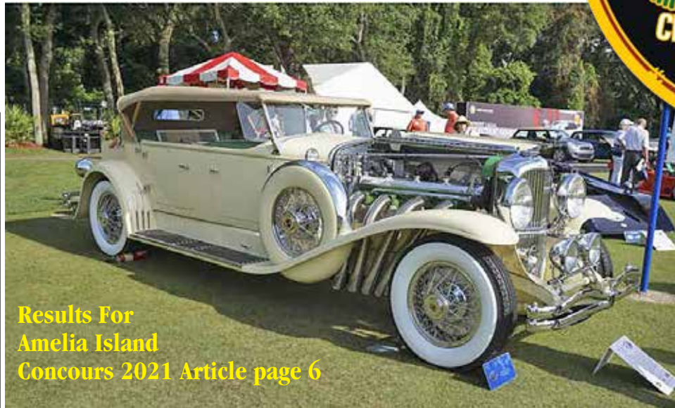
Results For Amelia Island Concours 2021 Article page 6