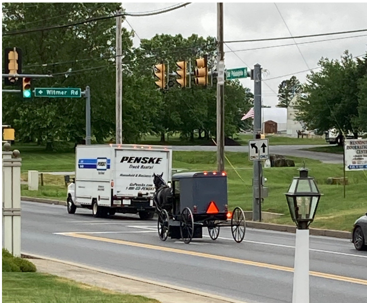
After the Concours, a short trip to Lancaster for some Amish sightings, including this "one horsepower" vehicle.