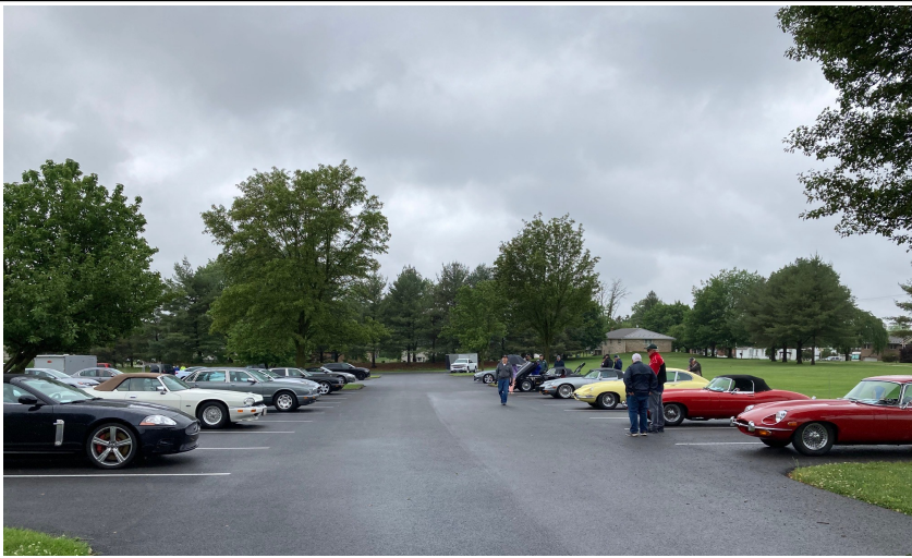
The 2021 SVJC Concours show field was moved from the traditional “on the grass” area of Sunset Lane Park to the parking lot due to the inclement weather.