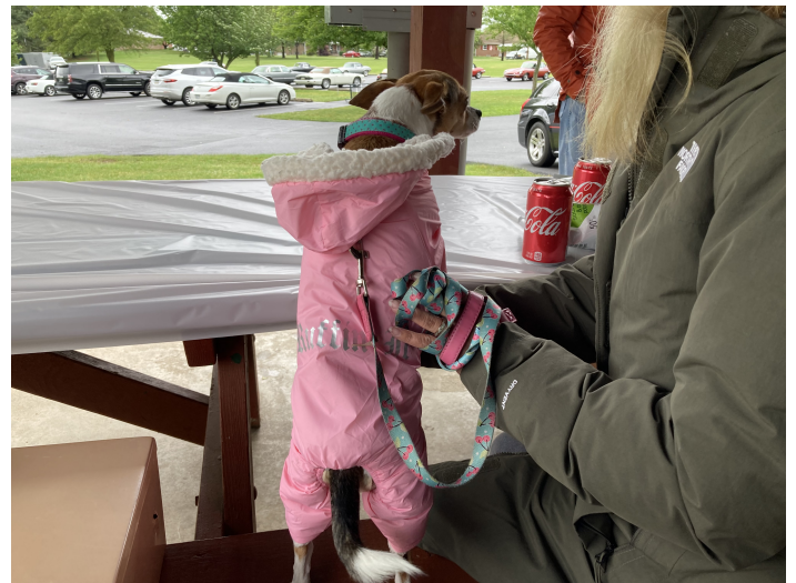
This cute pup was dressed for the weather at the SVJC Concours.