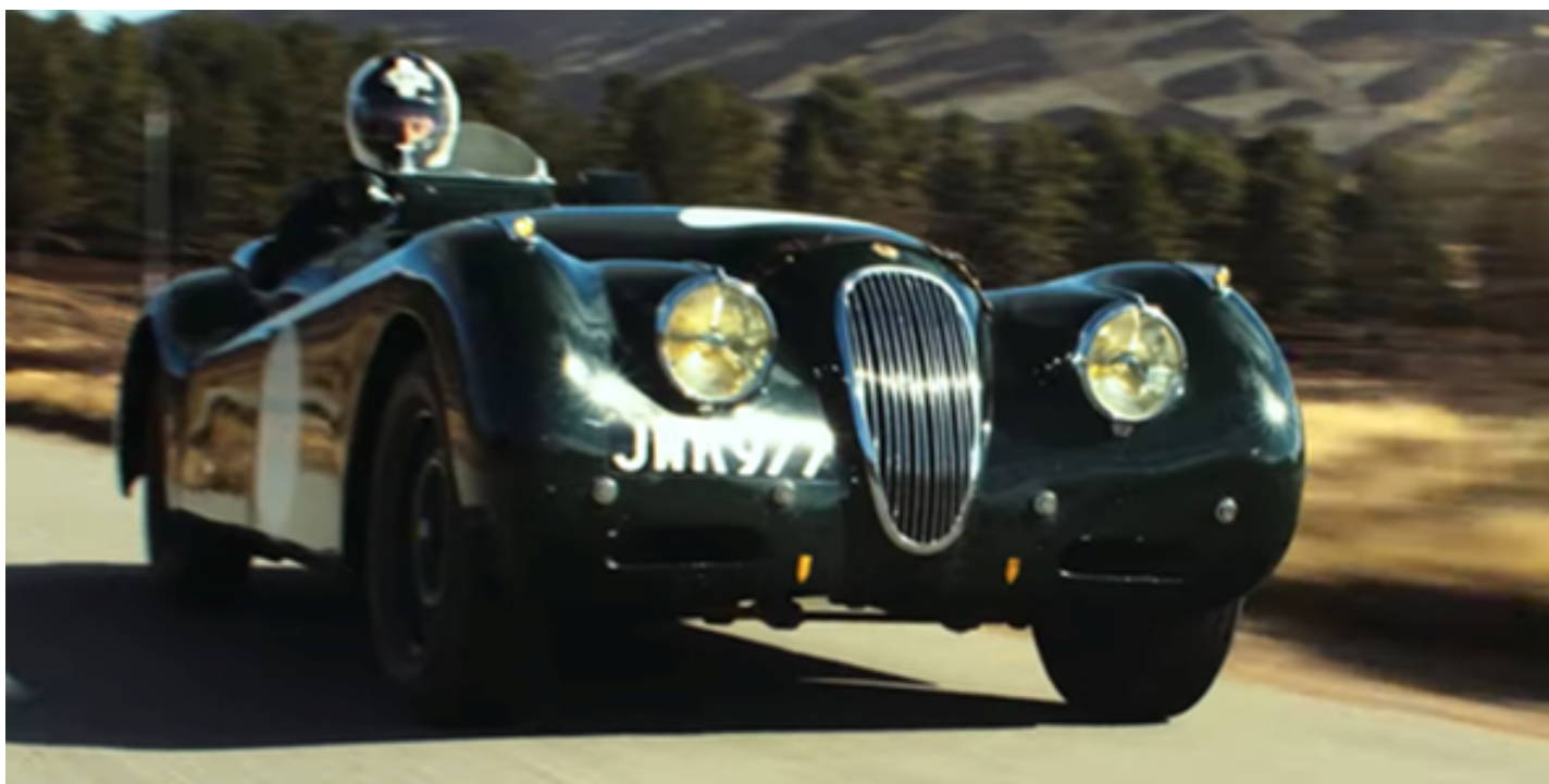
An XK-120 in racing form

In the 1950's and 1960's Jaguar proved it didn't need a purpose-built sports car to win races. Touring car racing of everyday road cars became quite popular. Private teams raced the Jaguar Mark 1 and Mark 2 Sedans during those early years with much success making the small sedan a racing icon.