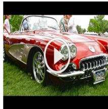
Colorado Concours Slideshow

Over 100 local and regional car clubs, businesses and media sponsors attract over 10,000. Now in its 39 th year, the show has become one of the most spectacular, most entertaining and anticipated car shows in Colorado!