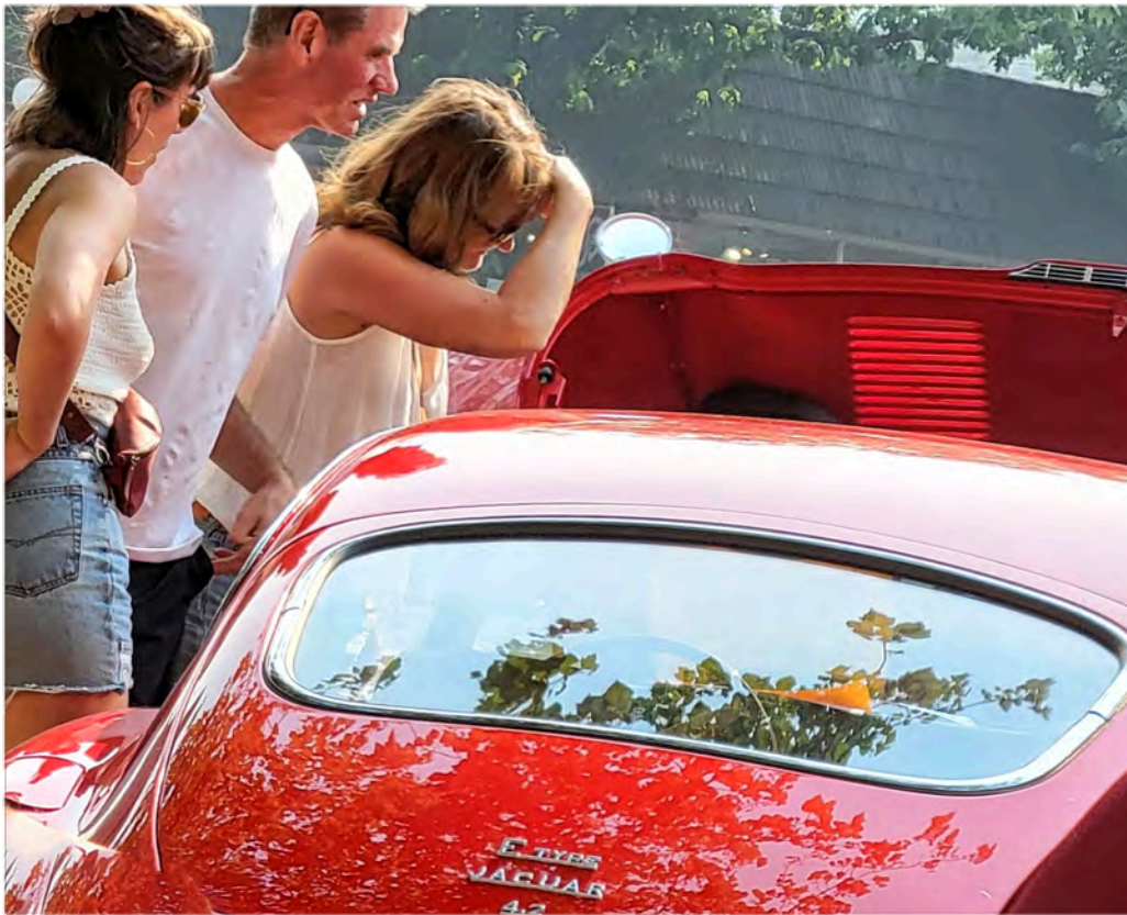
Bill's E type was particularly popular