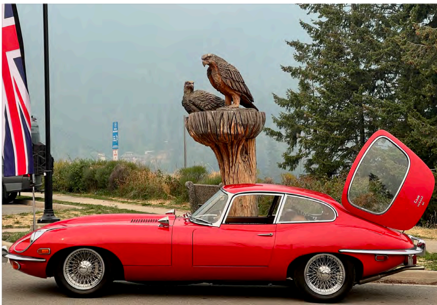
Bill's E Type Coupe at Kaslo

People vote for the "best in the show" with their wallets - 35 or so plastic yogurt containers are topped up by voter's money. It's on the honour system and Price Waterhouse is not needed to tabulate results or the year's honour. It's charming. It's almost as if people take turns being the winner.