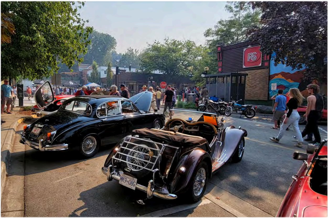
Chris's Mk 2 with the E types beyond along with a fine MG TF