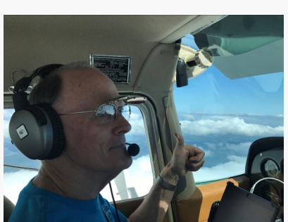
Ultimate social distancing at 3000 feet!!