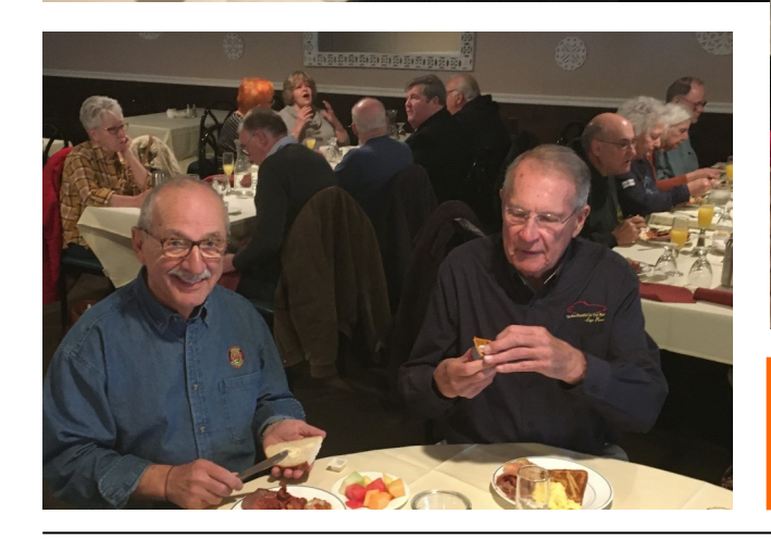
No one left hungry especially after the great dessert selections.