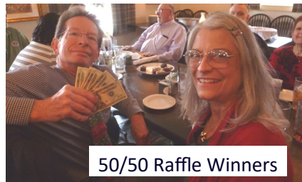
50/50 Raffle Winners