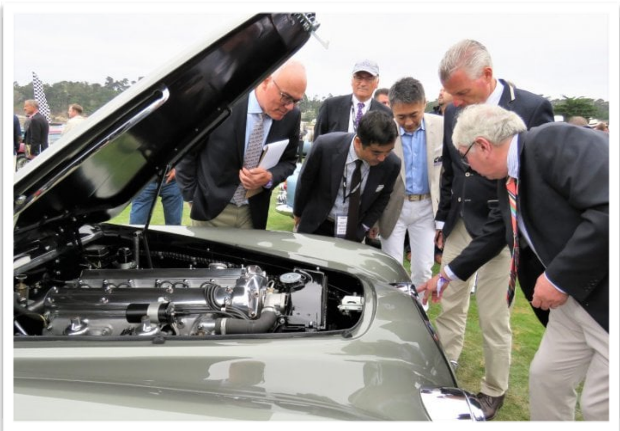
Judges at Pebble Beach examining a coach-built Jaguar

It should be noted that most events also have a "People's Choice" (fan favourite) award.