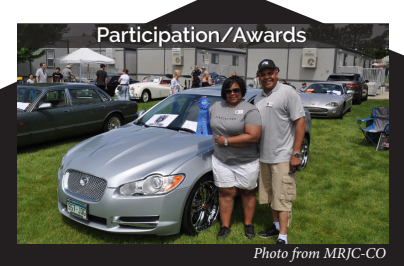
Join JCNA Today! Camaraderie · Participation · Competition

It's easy to take advantage of all that JCNA has to offer you and your family.