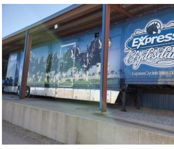
Overall, I enjoyed every minute from

planning, eating, visiting, and venturing out on this beautiful day. What a great fun group to hang out with! I cannot wait for the next luncheon and our outing.