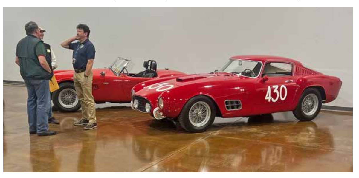
Continued on Page 5

There were several activities planned for those not attending the board meeting on Friday. The hotel had a nice breakfast each morning. The first event was a visit to RK Motors, a personal