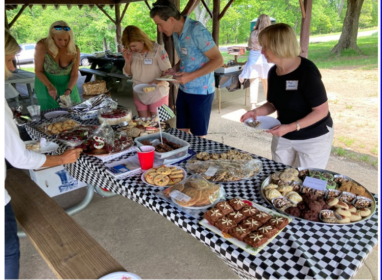
JCOP members and families enjoyed the good food and fellowship at last year's JCOP picnic.