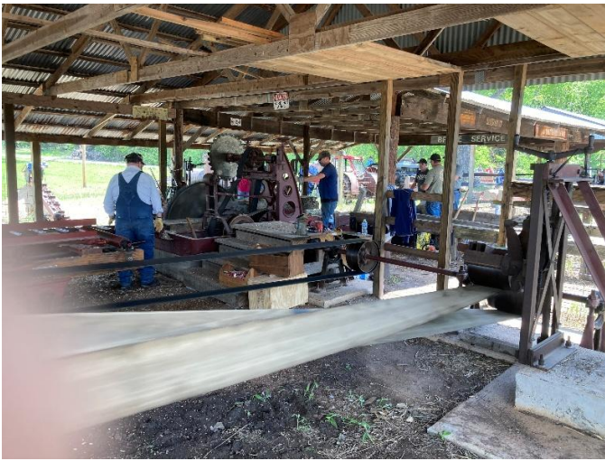
A saw mill run by a steam tractor.