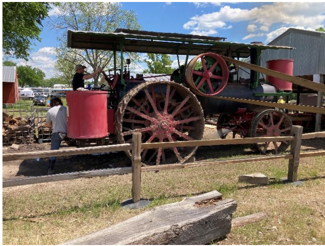
The huge steam tractor running the saw mill.

The entire show was a reminder of just how hard it was for farmers to provide crops. A side note was they had a single cylinder steam engine turning a 5 gallon ice cream machine.