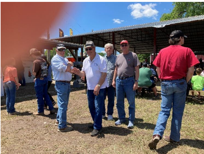
COJA members waiting in line for groceries.

There were only six members attending but were treated to a parade of steam tractors dating back to 1818.