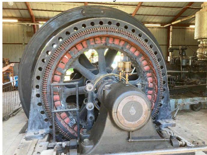
12' fly wheel from the zinc mine.

Last week the Guy's Day Out was attending the annual Steam Engine and Steam Tractor show at Pawnee, Ok. One of the features was the world's second largest engine. The engine was used by the world's largest zinc producer located in Blackwell. The steam engine provided the electrical power for the production plant to provide 10% of all the zinc in the world. The engine was so large it had a 12 foot diameter flywheel.