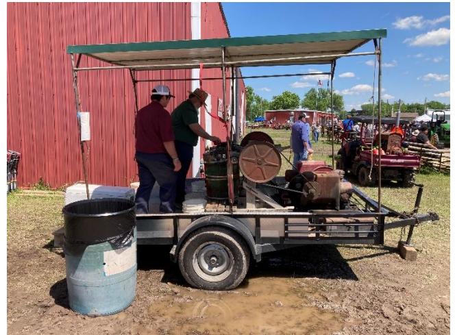
The steam powered ice cream freezer.

The entire show was a reminder of just how hard it was for farmers to provide crops. A side note was they had a single cylinder steam engine turning a 5 gallon ice cream machine.