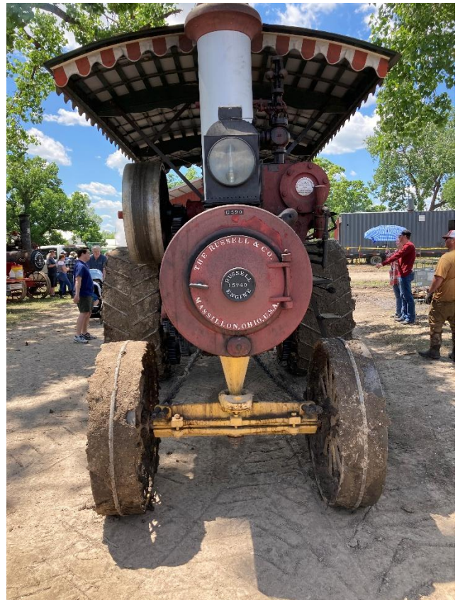
One of the many steam tractors.