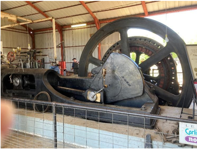
The steam engine driving the fly wheel.

There were only six members attending but were treated to a parade of steam tractors dating back to 1818.