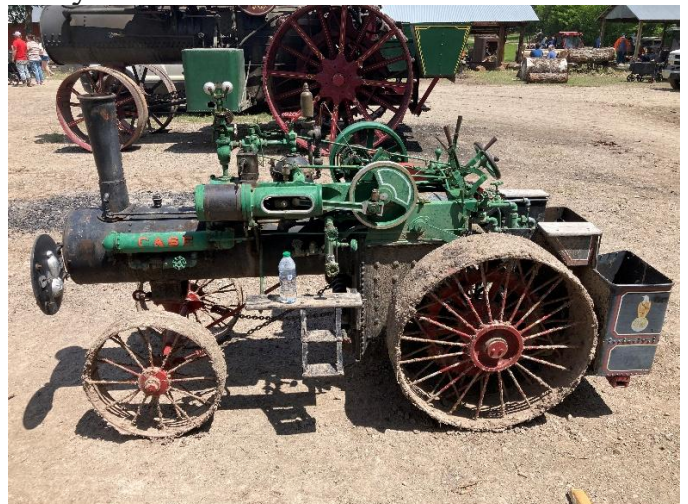
A miniature steam tractor.