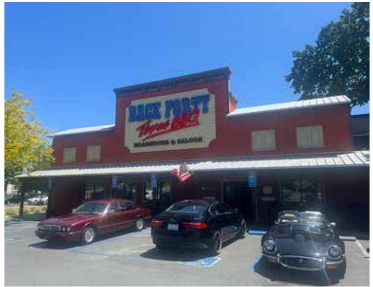
What an entrance.