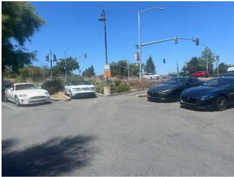
The Cats corner.