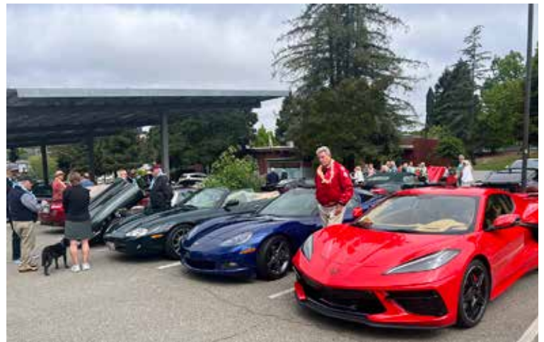
Corvettes playing with the Cats.