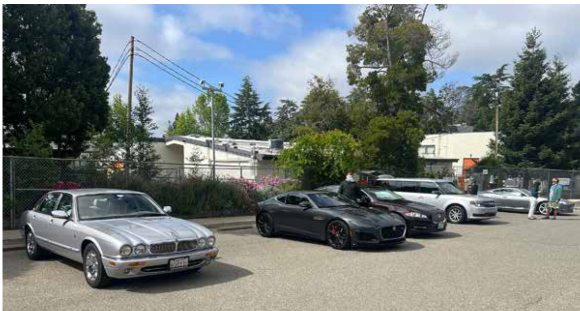
Speed and elegance.