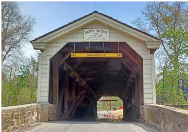
One of 5 wooden bridges from the 1800s.