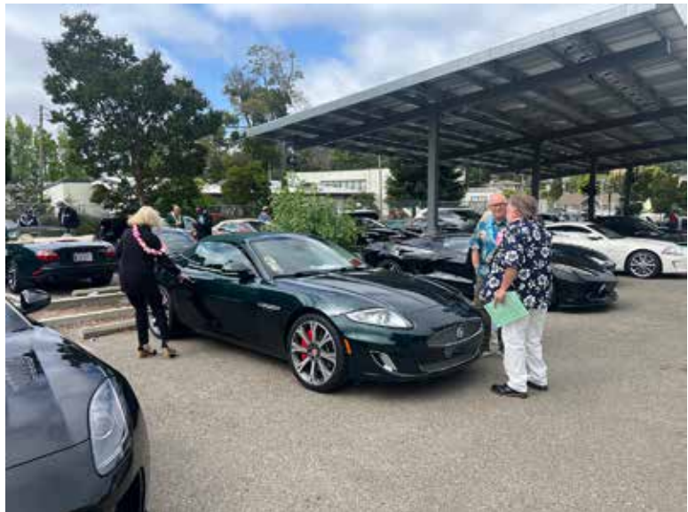
Aloha is alive in the East Bay.