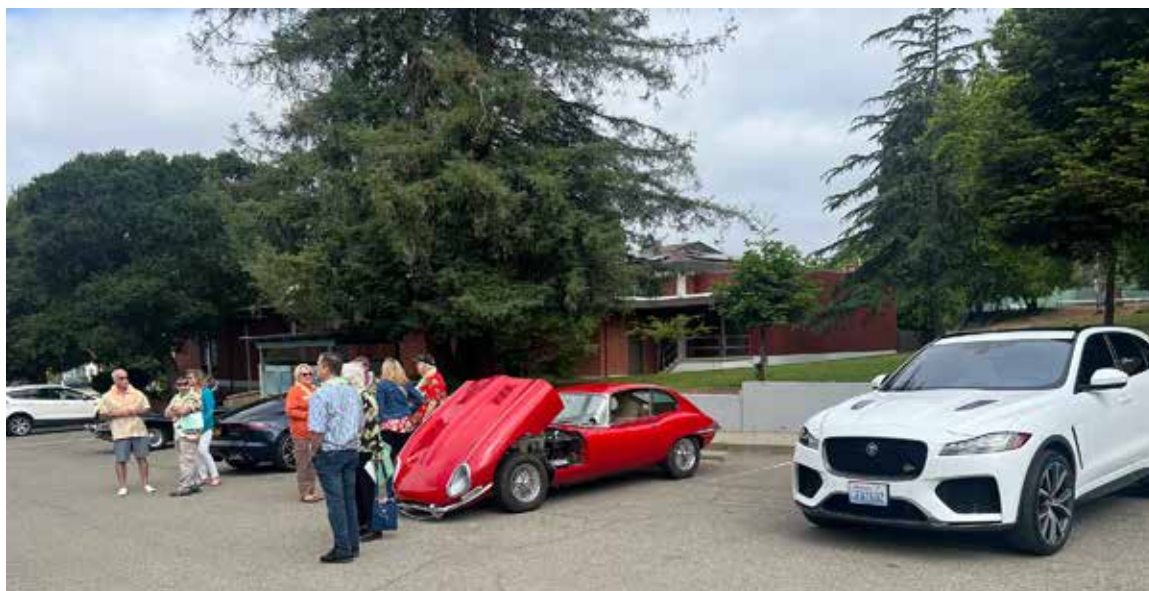
No matter the year one can always spot a Jag.