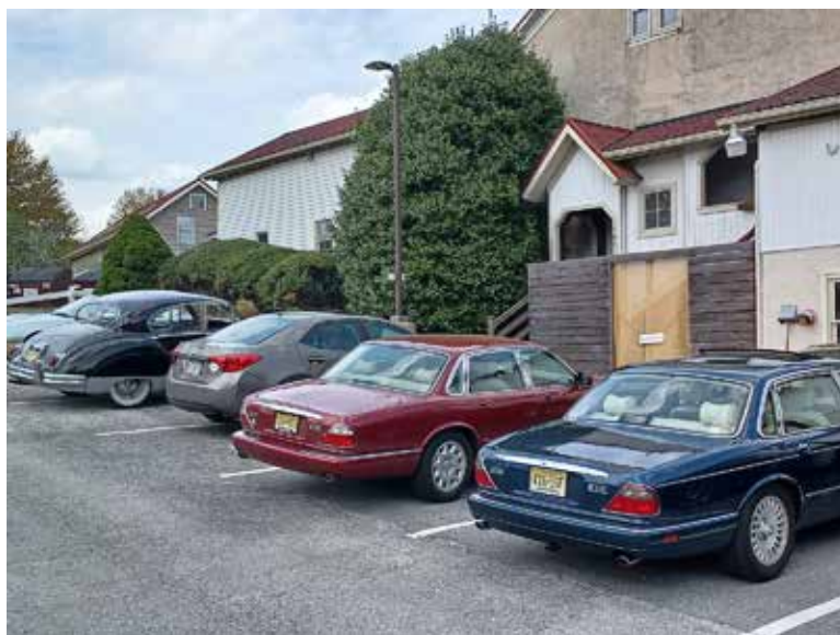
Beauty pausing for lunch.