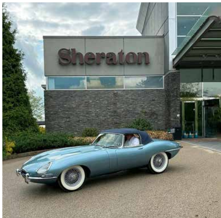
Sandor's arrival at the AGM.