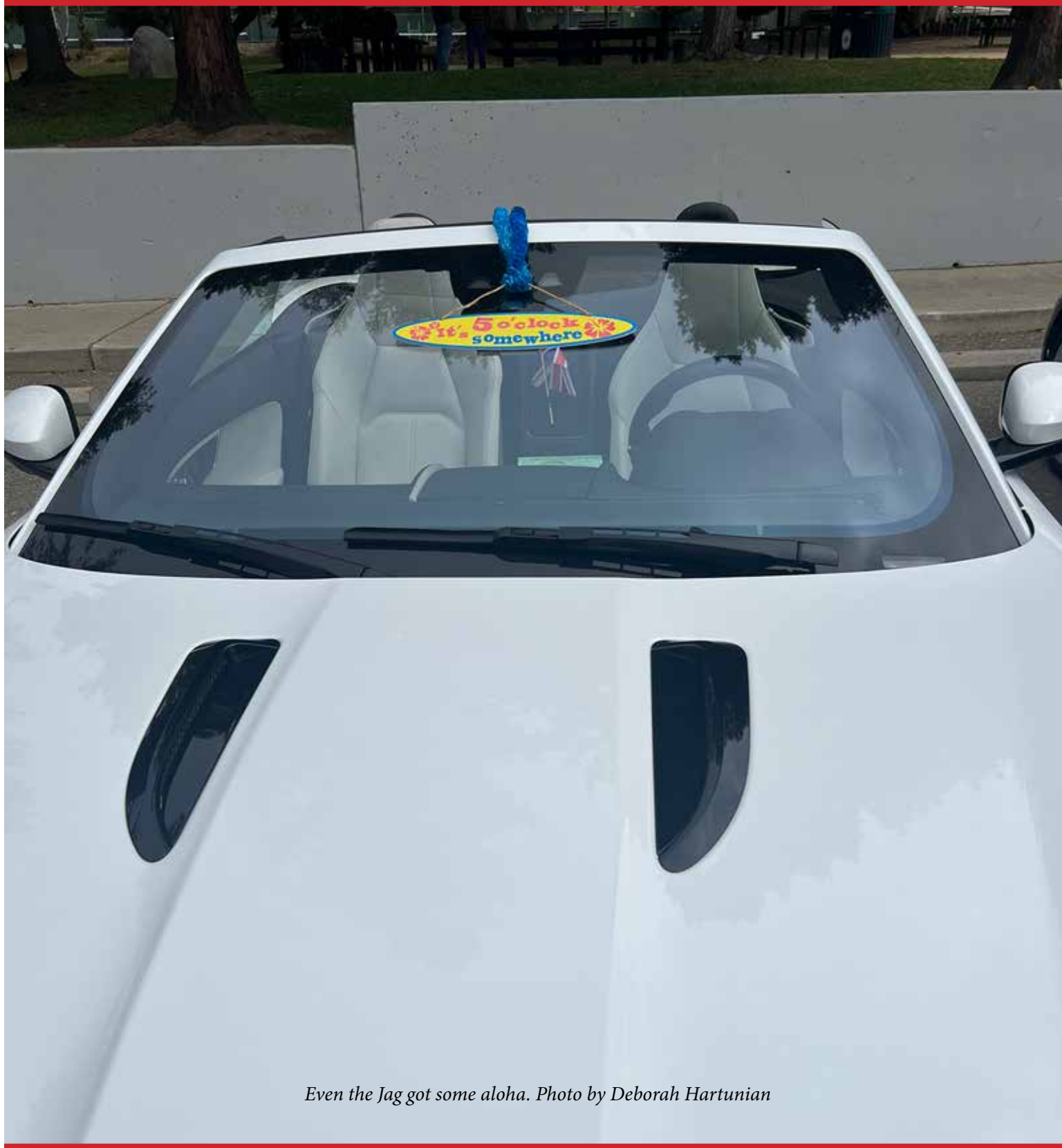
Even the Jag got some aloha.