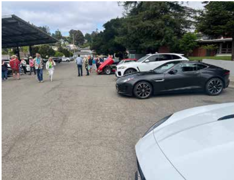
Waiting to prowls.