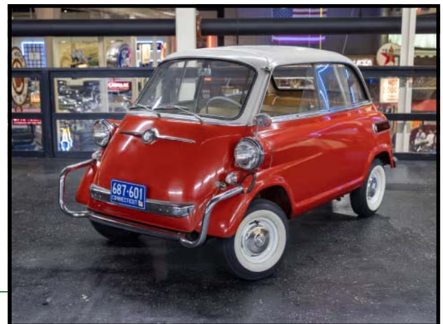
1959 BMW 600 Limousine