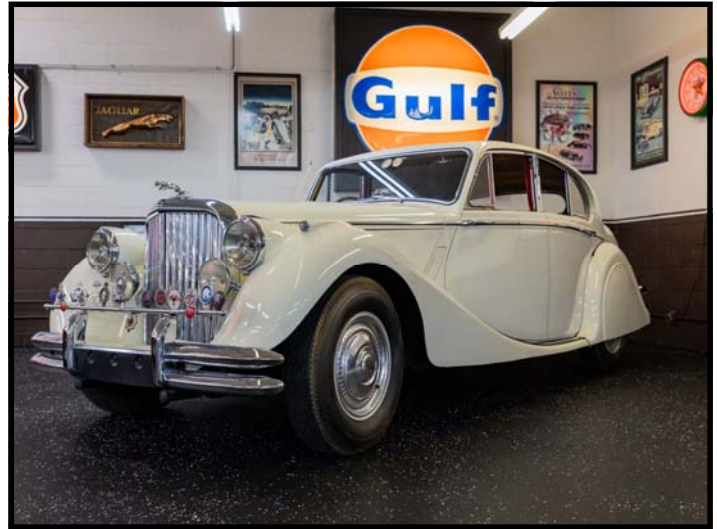
1950 Jaguar MK5