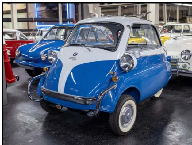
1957 BMW Isetta