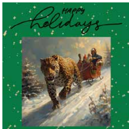
Photo Credits in this JAGazette edition.