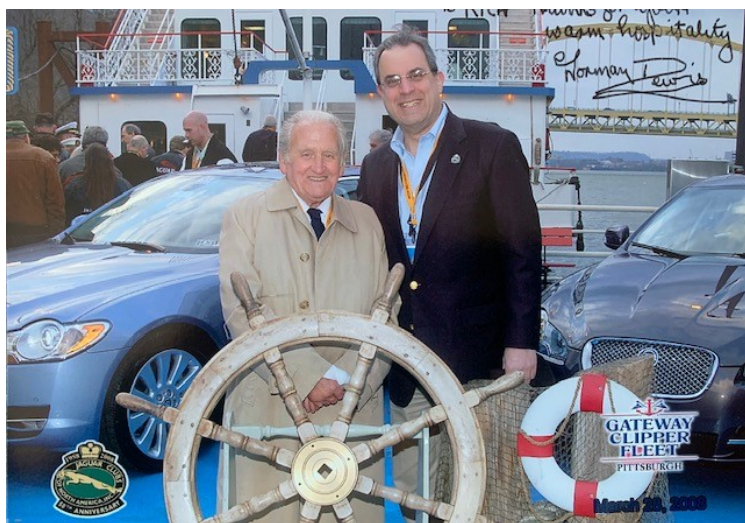
With Mr. Dewis!!!

I’ll never forget our very first sighting of the “new” XF were display cars at the Pittsburgh-hosted AGM also featuring the immortal Norman Dewis , engineer and test driver for Jaguar in the immediate post WWII period when the C-Type and D-Type along with the XK-120 through XK-150 models were developed, raced and sold in the United States. (photo below)