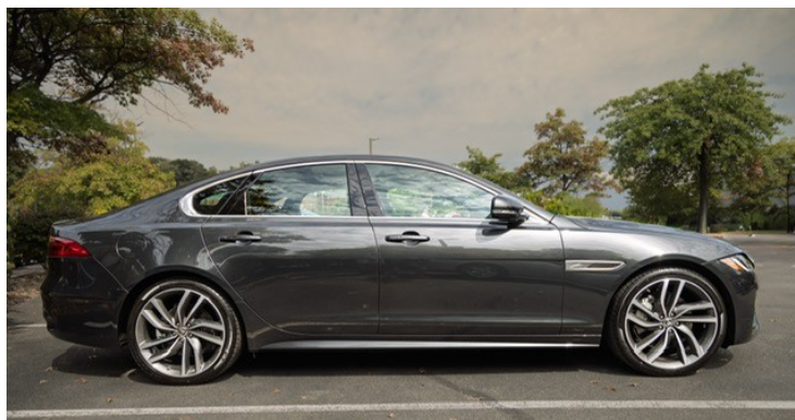
At left: My daughter Esther and her first-generation Rhodium Silver 2009 XF purchased new.