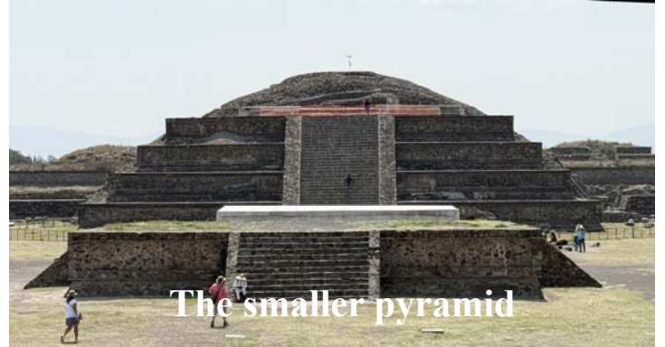
The smaller pyramid