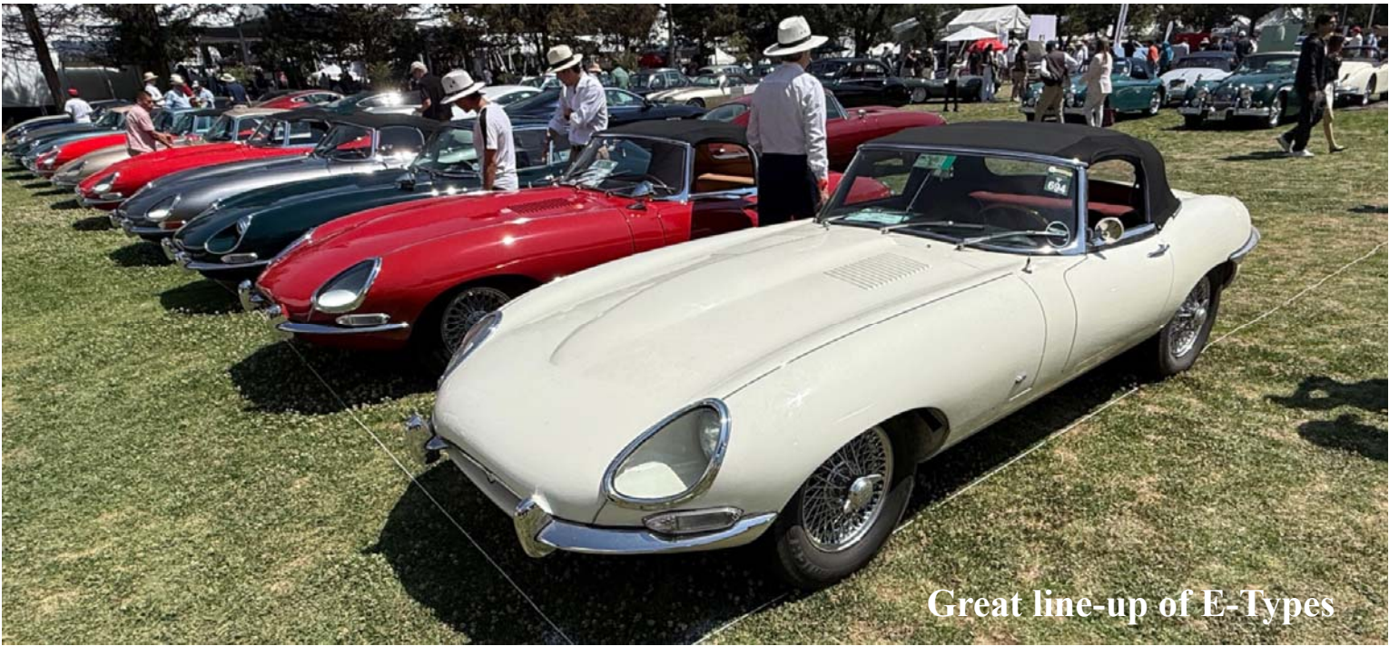
Great line-up of E-Types