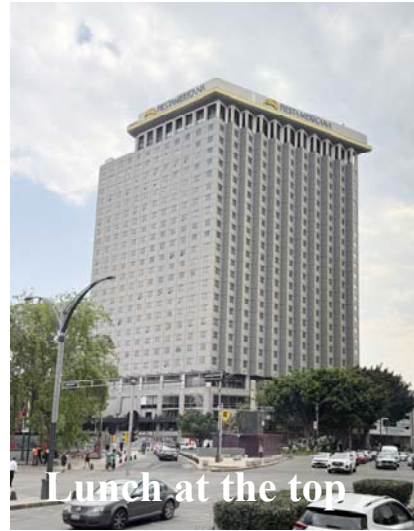
Lunch at the top