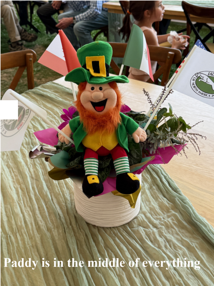
Paddy is in the middle of everything