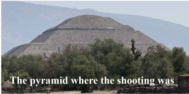
The pyramid where the shooting was