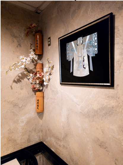
Artwork at the Hunan Pearl