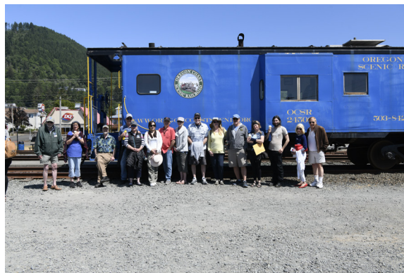
JOCO members had a blast at our most recent adventure 7/13/2024 on the Oregon Coast Scenic Railroad

Saturday May 2nd Joint drive to Garibaldi with the Mustang Wranglers. (Note: This is a "fair weather only event for the Wranglers). Meet at the McDonalds in North Plains, caravan to Camp 18 for breakfast, then caravan to Garibaldi via Hwy. 53 and Miami Foley Rd. to the Oregon Coast Scenic Railroad. Daily drivers welcome if the forecast shows rain probable. More details and sign up on our website.