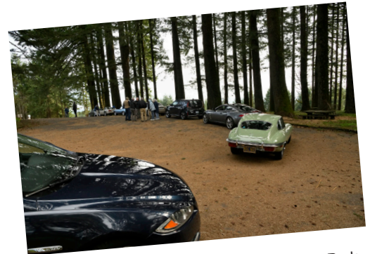
Evergreen drive stop over at Bald Peak State Park