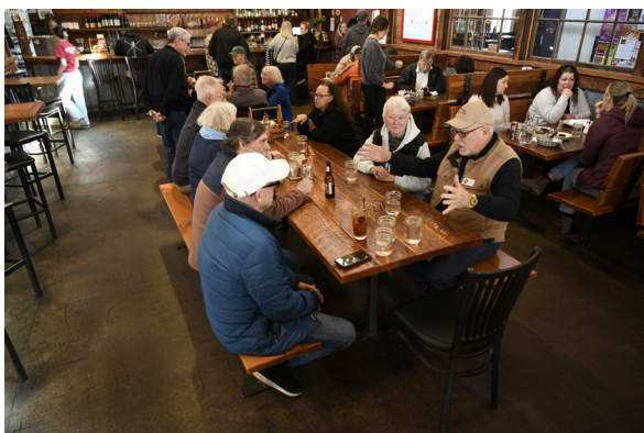
Settling down for some conversation before orders were taken at the Grain Station Brew Pub in McMinnville