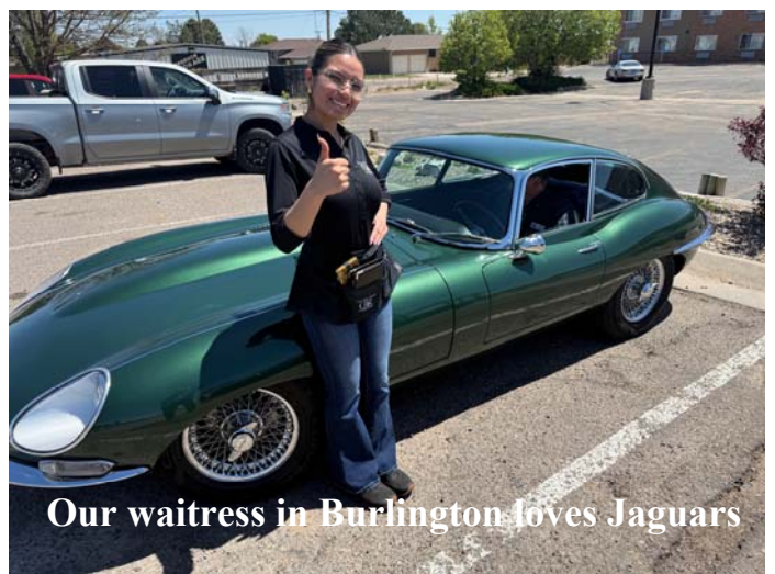
Our waitress in Burlington loves Jaguars