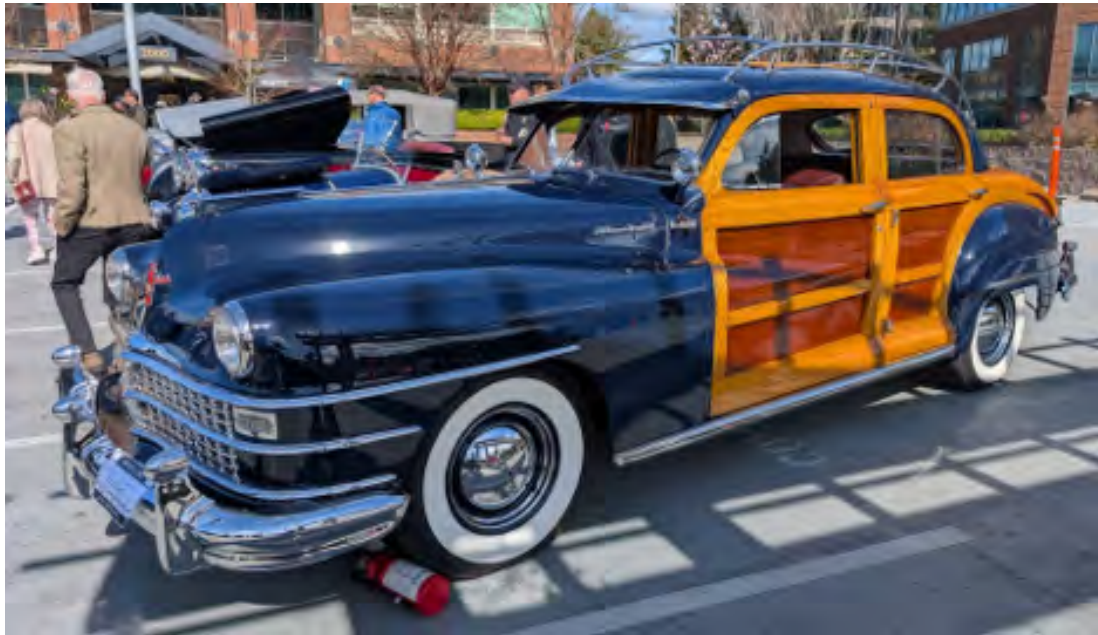
1947 Chrysler Town & Country with original wood

The wood in the 1947 Chrysler Town & Country, for example, was noted as original so minor dings could be forgiven. Even with that in mind, the woodwork was in exceptional shape for the age.