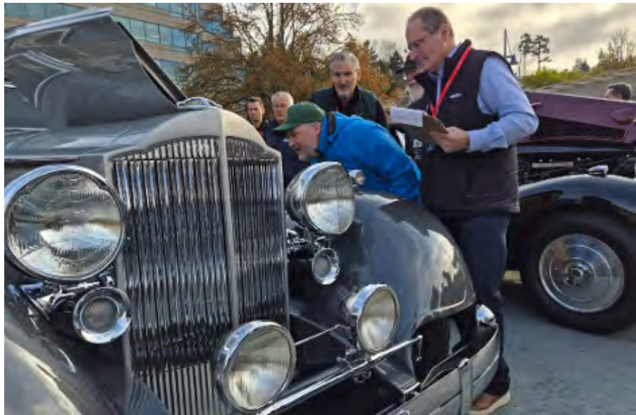
'Reviewing the engine of a 1934 Packard'

For any deduction, only whole points are used so counting up stone chips and minor scuffs becomes more of an exercise in looking at the vehicle as a whole. For context, our Jag Concours uses tenths of points for minor flaws which makes it easier to just add them up on each panel.