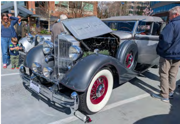
1934 Packard engine bay

The biggest difference between CCCA judging and our Jaguar Concours (or any single-make judged event, I believe) is their approach to authenticity. Judged classes are based on time period, not specific models, so judges are not expected to know the minutiae of each model. That's not to say authenticity is ignored, but it's focused more on the time period. For example, spark plug technology changed in the 1930's so being able to recognize the differences is important.