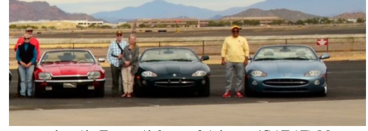
Commemorative Air Force Airbase of Arizona (CAFAZ) Museum, pg 5