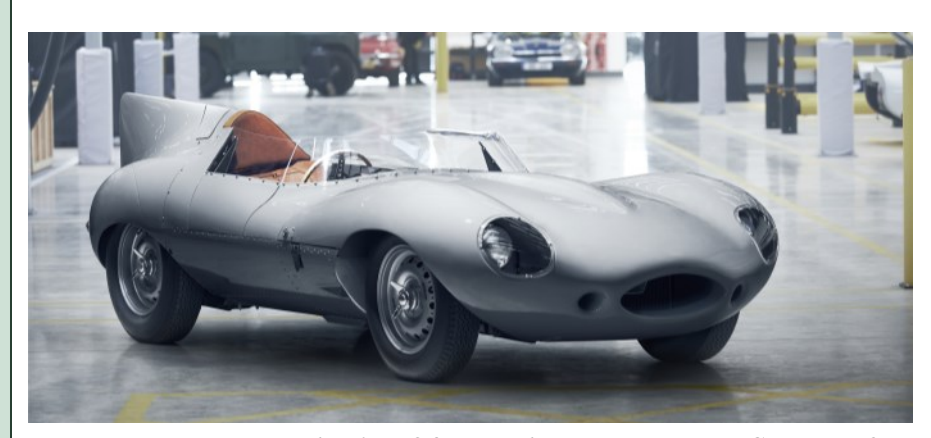
Jaguar Restarts Production Of Legendary D-Type Race Car, pg 7-9