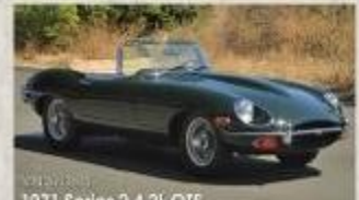
VIN# 1E1081 1971 Series 2 4.2L OTS