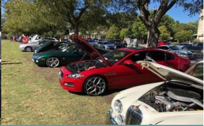
Amazing display of Jaguars at ABCD