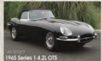
VIN# 1E1077 1965 Series 1 4.2L OTS