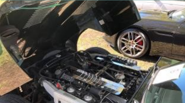
WoW! Now that's an amazing engine!