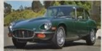
VIN# 1E1074 1971 Series 3 V12 2+2