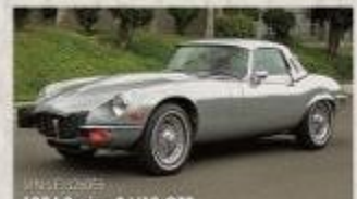
VIN# 1E1085 1974 Series 3 V12 OTS