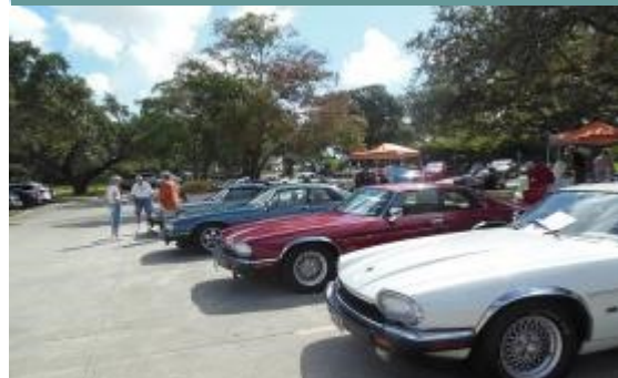
Various classes of Jaguars on display at our Concours (by Brian B.)