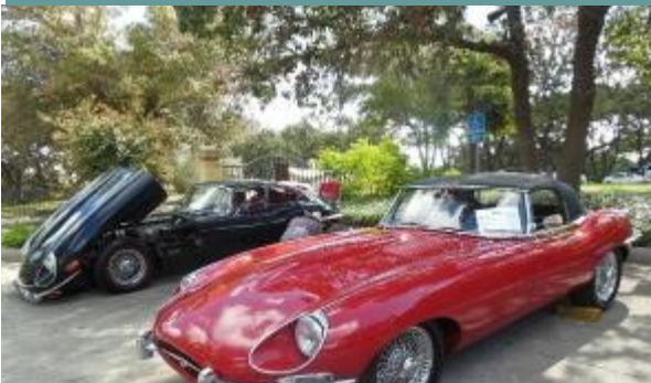
LtoR: JJ & Rebecca Keig's 1967 E type FHC—blue; Jay Zinser Jr's 1967 E type DHC—red