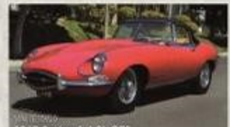
VIN# 1E1069 1967 Series 1 4.2L OTS