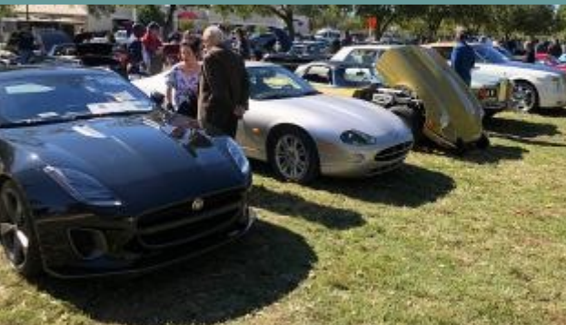
Beautiful Jaguars on display (by Brian B.)