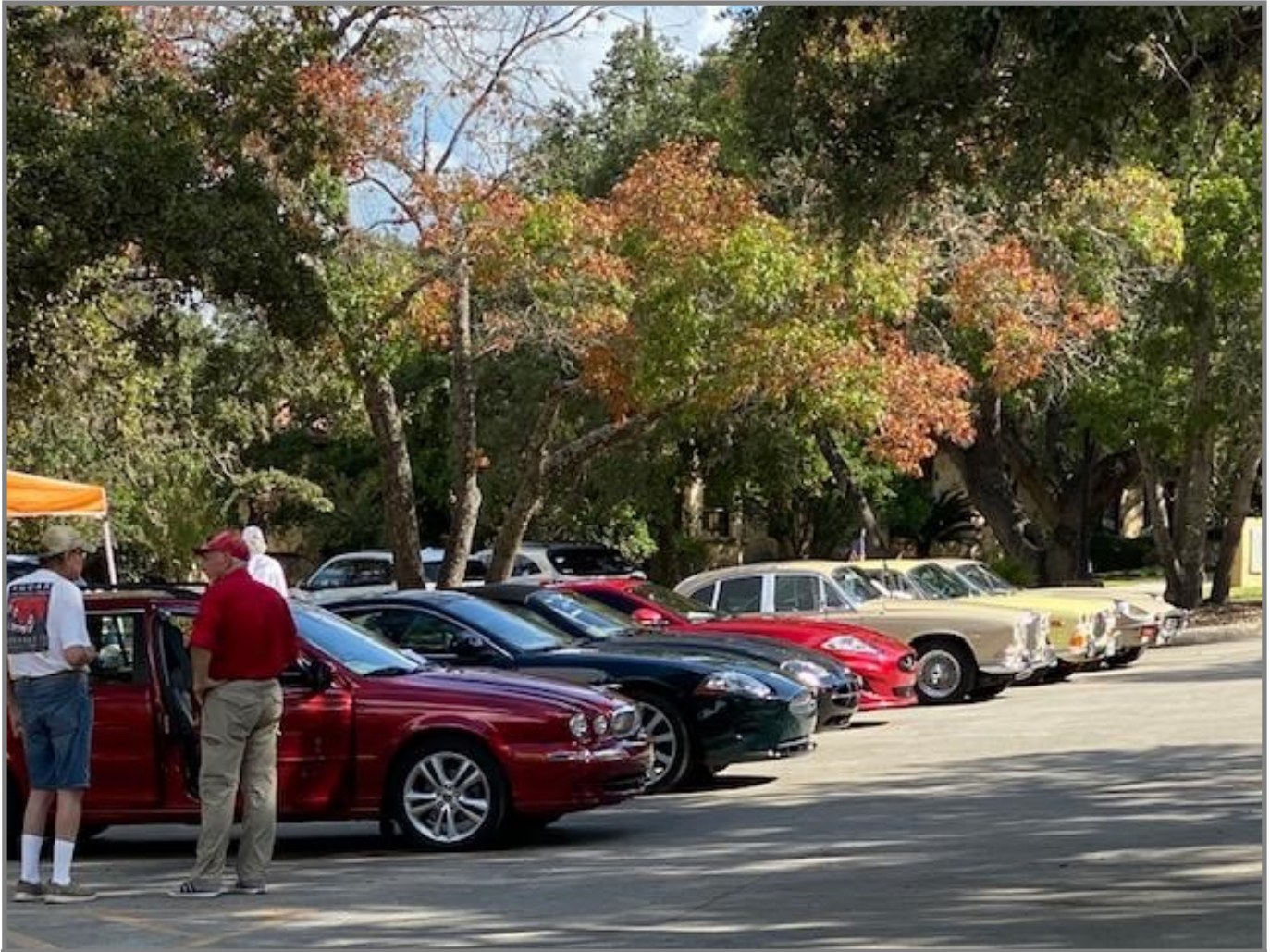
A wide of various Marques of Jaguars lined up for judging at our SAJC's 27th Annual Alamo City Jaguar Club's Concours at the Club at Sonterra in Historic San Antonio, Texas