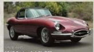
VIN# 1E1070 1967 Series 1 4.2L OTS