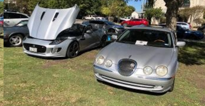
More amazing Jaguars