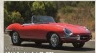
VIN# 1E1088 1966 Series 1 4.2L OTS