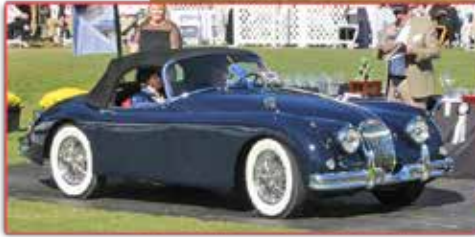
Best in Class Roy & Linda Cleveland Class 04C Sportscars XK150 for their 1960 XK150SE Open Two Seater