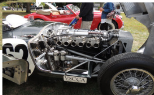
Tom Jaycox's (Canaan CT) 1953 racing C-type. Inset, the C-type's amazing power plant! Beautiful even when still.